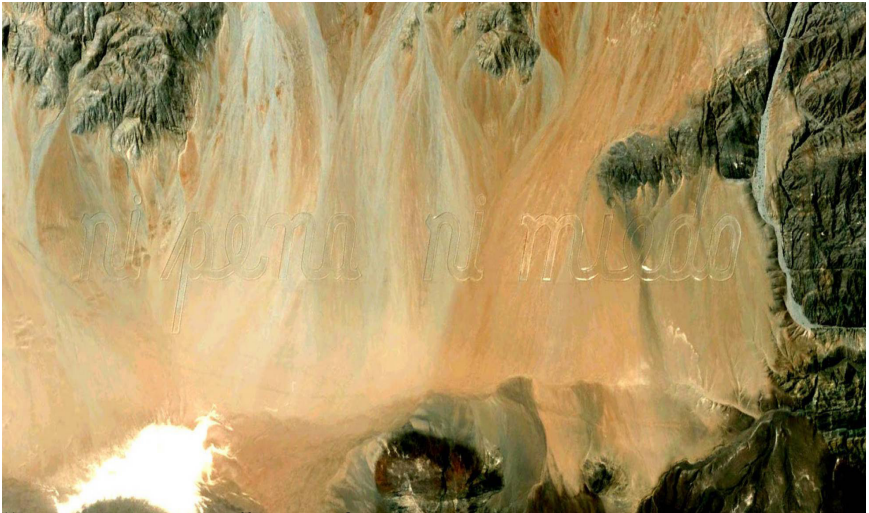
“Ni pena ni miedo” taken from above in the Desert of Atacama.